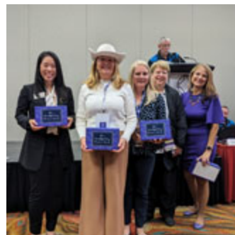
Third Place: The Disruptive Directors