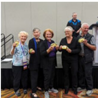
First Place: Sigma Spice Girls and Guy

Thank you to all who joined us for the inaugural, sold-out, Fun-Raiser for Research benefitting the Sigma Foundation for Nursing Research Fund. Over US $5,000 was raised for the Research Permanent Fund through ticket sales and mulligans. An additional US $32,000 in annual donations and Fellow pledges was contributed to the Foundation's Future, Leadership, and Unrestricted Funds by convention attendees.