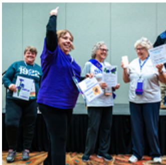
Second Place and Team Theme Winner: The Sigma